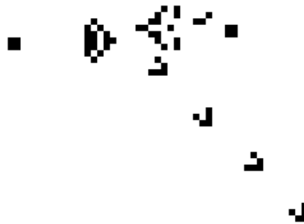
Figure 13.9: ...in action.