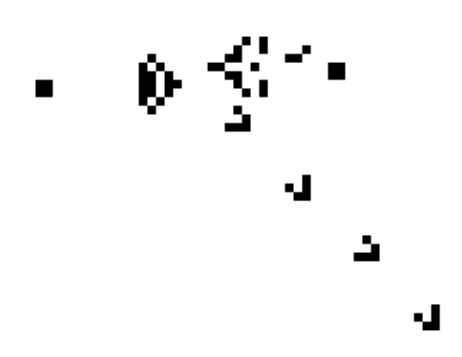
Figure 13.2: ... in action.