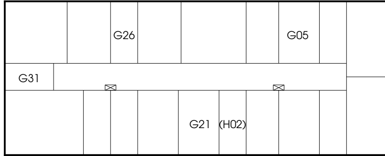
Figure 2. Floor plan of the building where the described system evaluation has been carried out. Base station positions are indicated by crosses; room H02 is on the next higher floor.